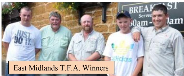
East Midlands T.F.A. Winners