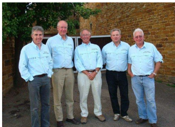
Invicta F.C. 'A' Team - Winners