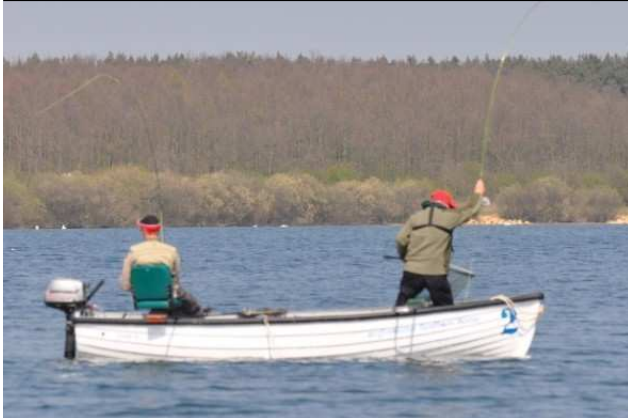
Two fish to the boat – Drifting across the entry to Savages Creek

Sadly, those anglers who fished the Western End did not fare so well.