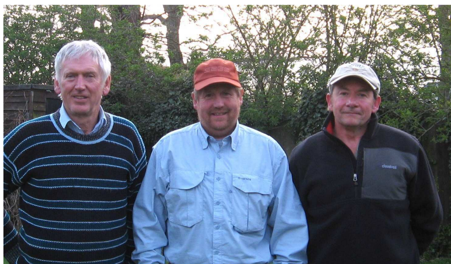
Queen Mother F.F.